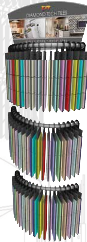
2 Vertical Wall Display 32" W X 8" D x 70" H