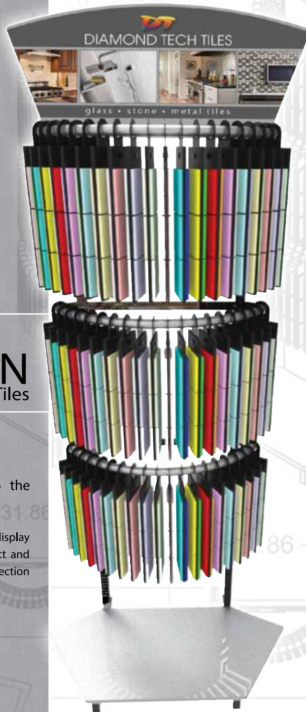
1 Floor-stand Display (holds 120 cards) 32" W X 22" D x 76" H

The COLLECTION is a sophisticated tile display designed to entice customers to browse, select and purchase tile from Diamond Tech's extensive selection of glass, stone and metal tiles.