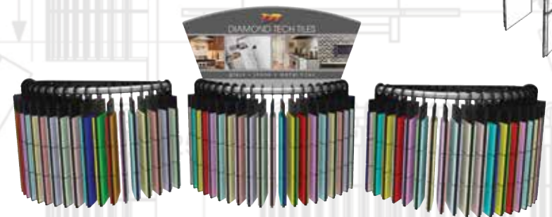
3 Horizontal Wall Display 78" W X 8" D x 25" H

The COLLECTION is a versatile tile display which can be configured to fit any showroom. Use the display as a free-standing unit or mount it vertically or horizontally as a wall display.